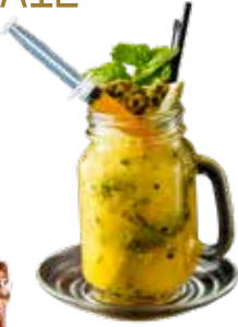
Virgin Passion Fruit Mojito