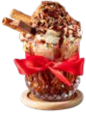
Choco Banana Cracker