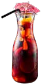
The Red Wedding

Nothing tickles your fancy? Ask our bar for a customised cocktail!